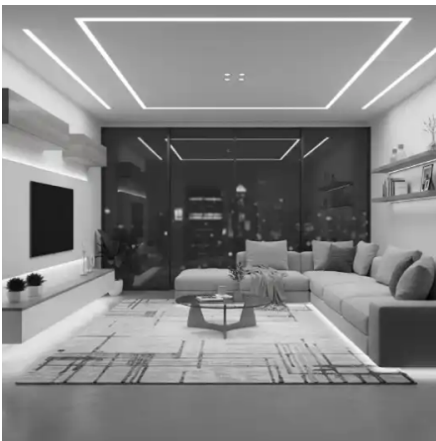
Suitable for Residence