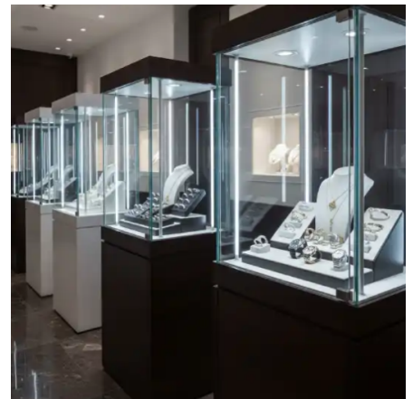
Suitable for Commercial