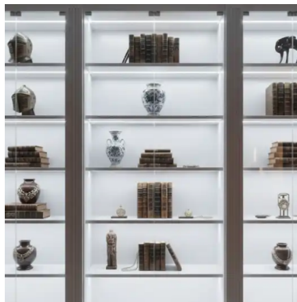
Suitable for Decoration